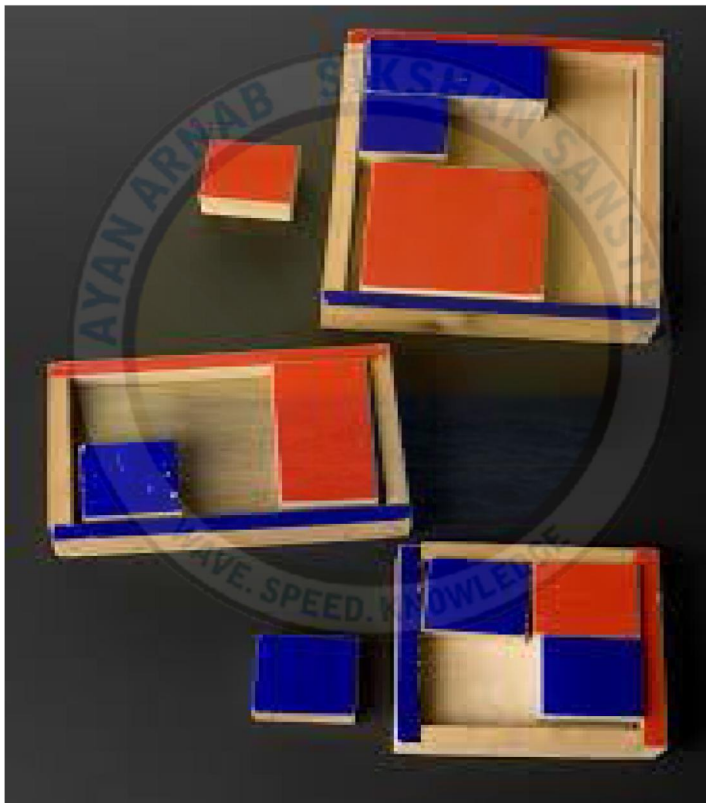
Alexander Pass Along Test