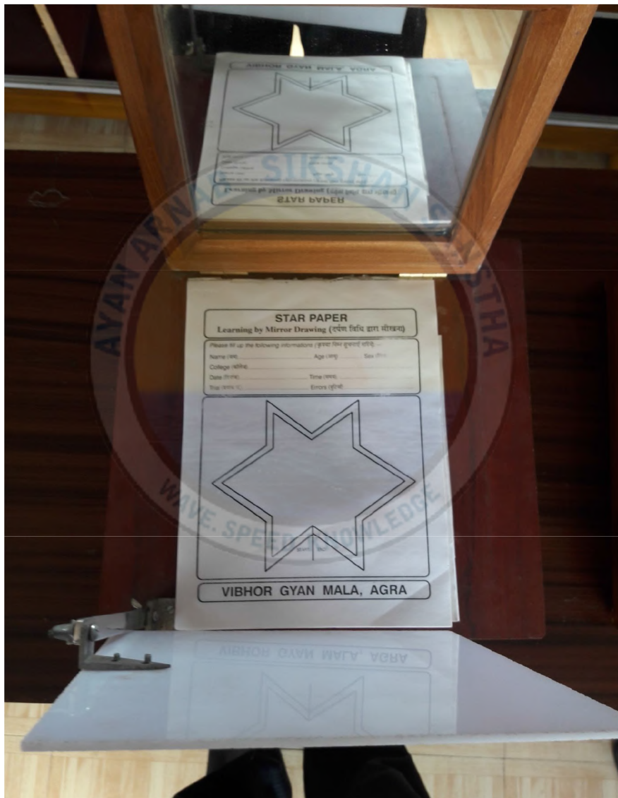
The Mirror Drawing Apparatus