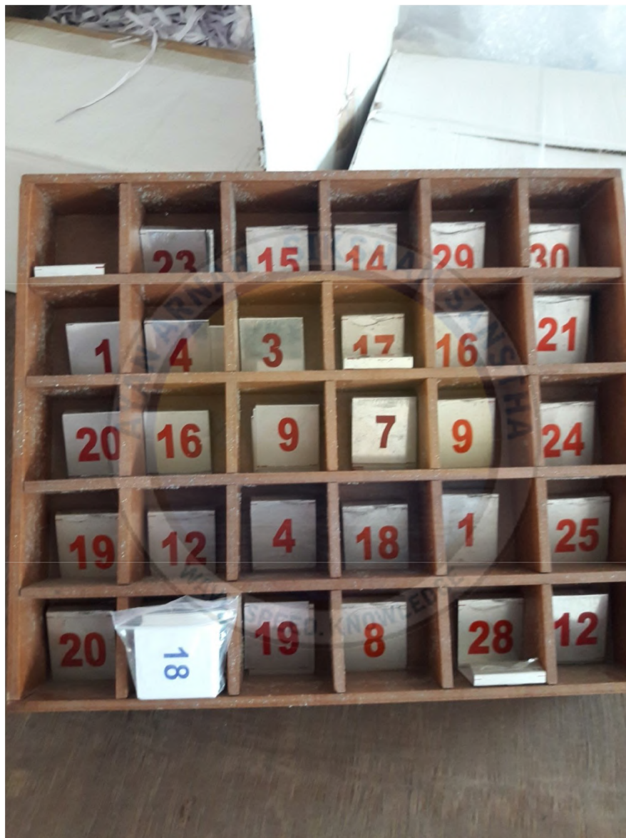
Card Sorting Tray